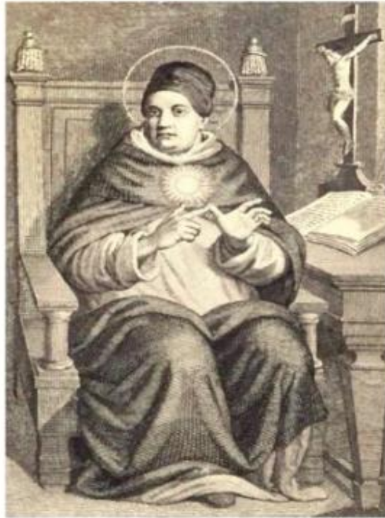
St. Thomas Manual or The Devotion of the Six Sundays in Honor of the Angel of the Schools